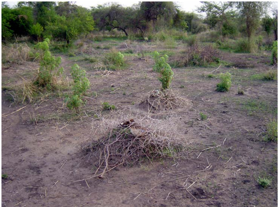
A cemetery in Wudeir, Eastern Upper Nile is filled with recent deaths from measles. Each pile of brush represents a child's grave. Over 600 deaths have been documented by local authorities between December 2004 and May 2005.

This Spring, Servant's Heart reported at least 500 deaths from measles in Daga Post, Eastern Upper Nile. Thanks to your generosity, we were able to fly in a plane of medications to help sick children survive the disease and lessen the effects. We treated over 500 children within days.