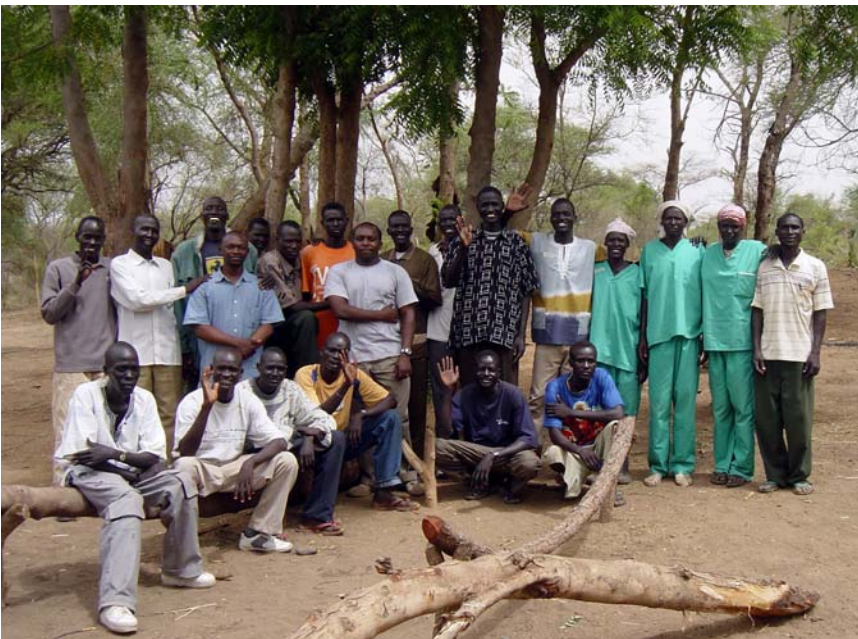
Completing the first session of Community Health Training, these community leaders from Daga Post are committed to teaching others about sanitation, hygiene and basic nutrition. They formed a Community Health Committee to monitor and report the on-going health behavior of the village.

Thanks to two trainers from Kenya, the community of Daga Post is healthier. We are grateful to Medical Ambassadors International for partnering with us in to train community leaders in the basics of healthy community behavior.